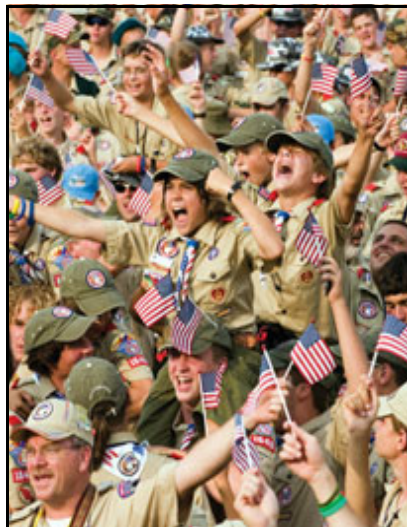
Scouts react to President Bush's address at the Arena Show .

Less than 20 minutes after it started, President Bush's speech was over and he leisurely made his way across the front of the stage, back through a crowd of appreciative Scouts and out the door to the relief of the Secret Service. The band played on with songs of patriotism and significance, as we continued our celebration of Scout spirit.